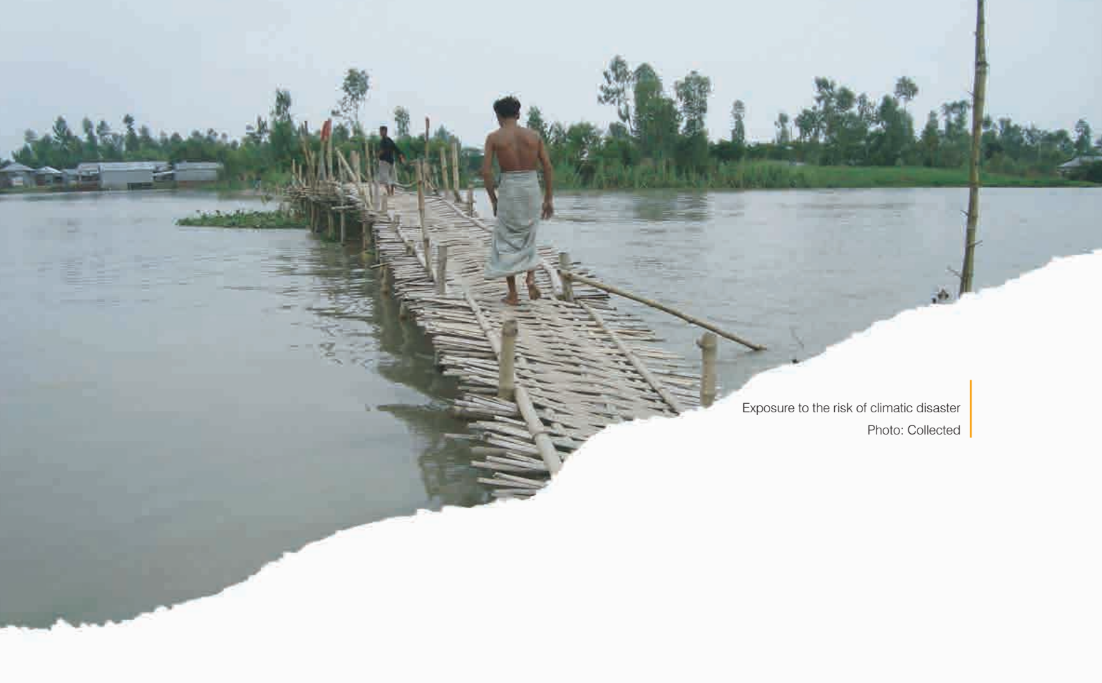
Exposure to the risk of climatic disaster

Climate-induced displacement and migration involve two different dimensions; a) cause dimension e.g. climate-induced disaster events and their residual impacts, and b) consequence dimension e.g. socio-economic deprivation and violation of human rights etc.