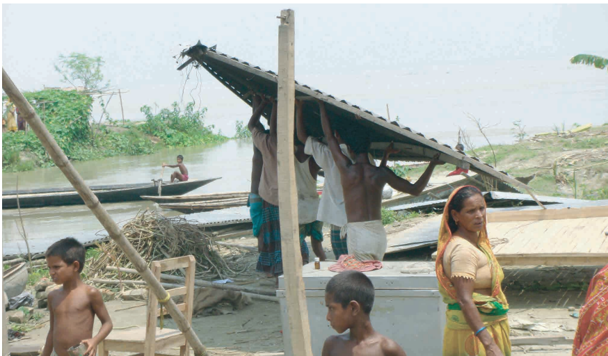
Climate-induced displacement